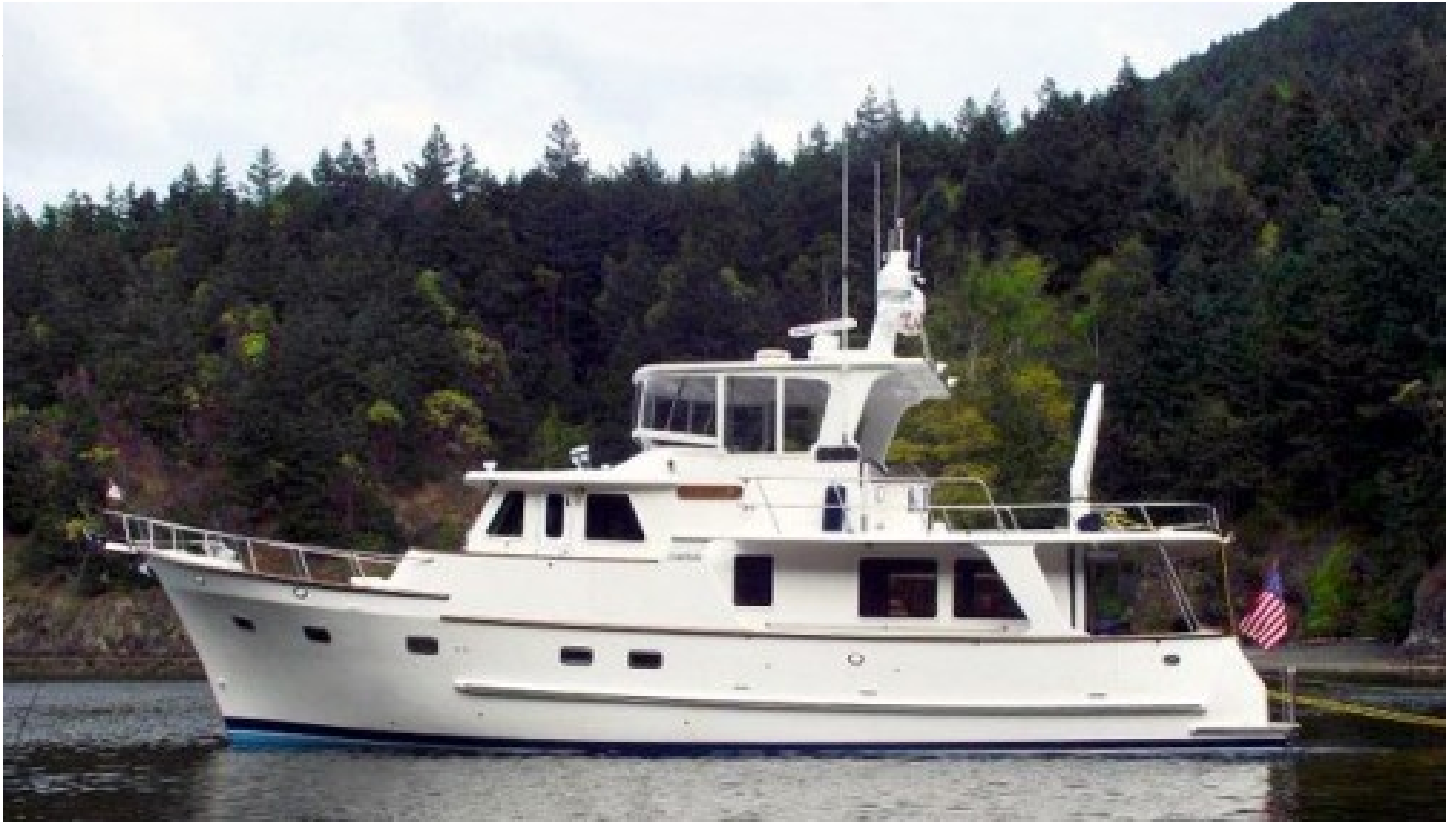
DeFever 52E Pilothouse